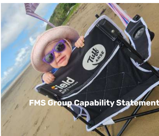
FMS Group Capability Statement

“FMS Group donates well over $200,000 each year to support community initiatives and organisations, helping our people thrive”